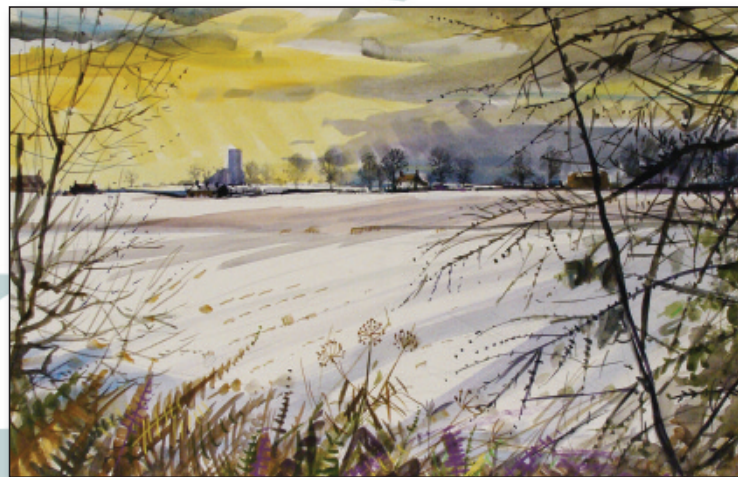
Midwinter scene, Bradfield