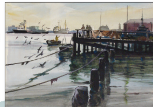
Watching the day go by, Great Yarmouth docks