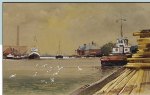
Timber at the dockside, Great Yarmouth